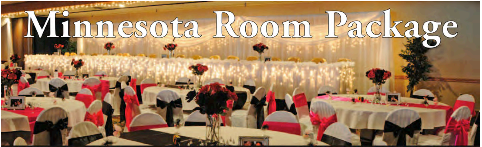
Breezy Point Resort — 2012