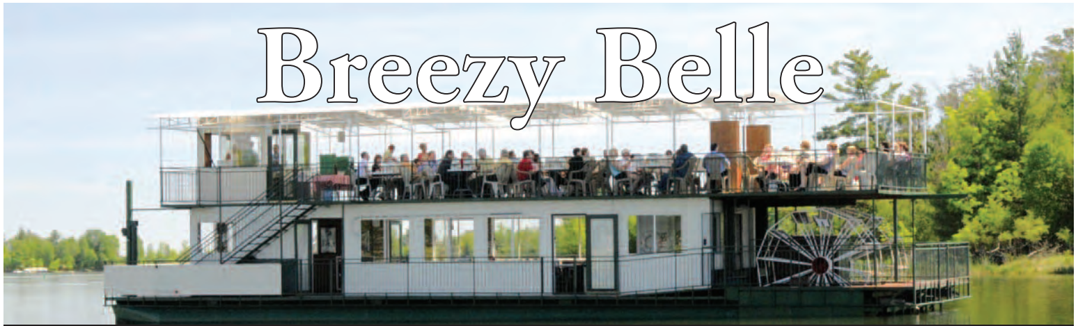
Breezy Point Resort — 2012