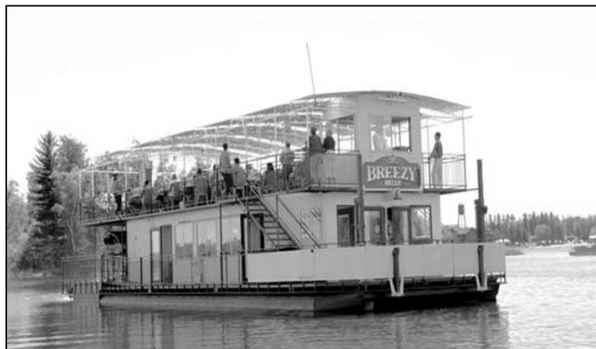
A relaxing evening cruise on the Breezy Belle.

The 2010 season, Breezy Belle's first on Pelican Lake, was a resounding success.