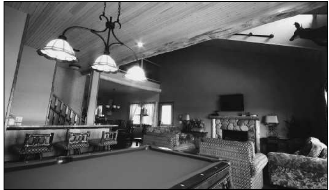
The Boat House has four bedrooms, four baths, a fireplace and a rooftop deck! This lake home is perfect for golfers, families and gatherings of all kinds.