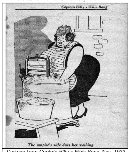
The umpire's wife does her washing.

The Antlers is renowned for fine dining in a casual atmosphere.