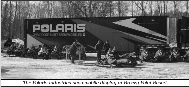
The Polaris Industries snowmobile display at Breezy Point Resort.

Polaris Industries, Inc. recently paid a 4-day visit to the Resort as a part of their national tour promoting their line of snowmobiles.