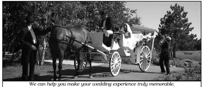
We can help you make your wedding experience truly memorable.

A true northern Minnesota lakeside resort, Breezy Point Resort has event space, a wide variety of lodging and dining options, as well as a long list of recreational and entertainment choices.