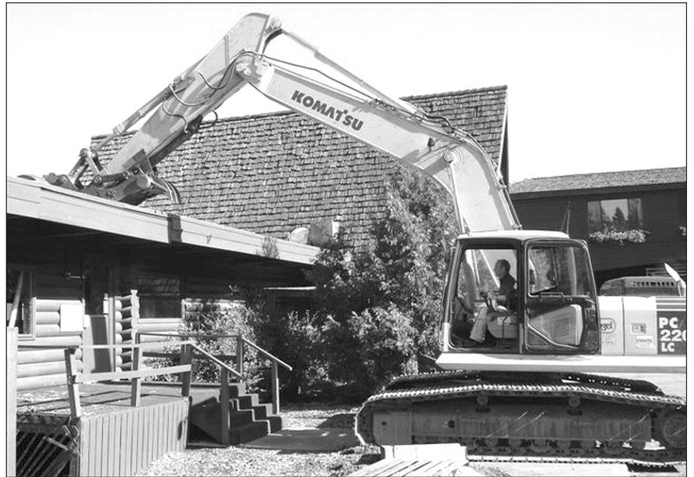
Bob Spizzo took the “first bite” out of the old Marina Restaurant & Bar on the morning October 3, 2007