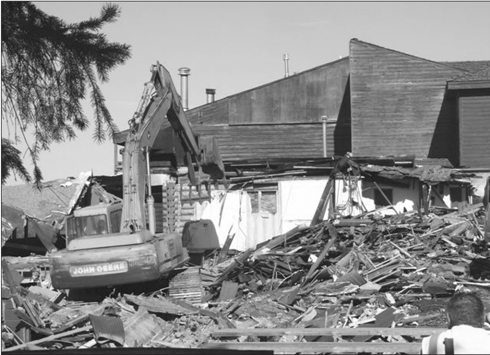
Demolition of the Breezy Point Resort Marina Restaurant & Bar

continued from page 1 Resort president, watched the demolition, he was asked if he was sad to see it go. He responded, "Absolutely not! This is a great day for the Resort, the community and the environment. It fulfills a major part of our long-term development plan. I think the only ones who are sad to see it go are the lawyers."